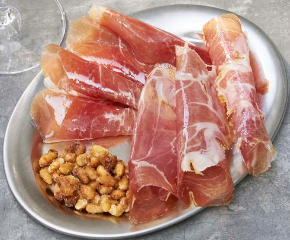
Mixed cold cut & Candy nut 420