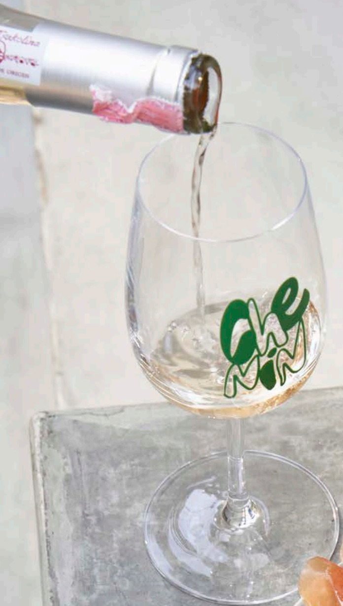
Wine by glass TBC*