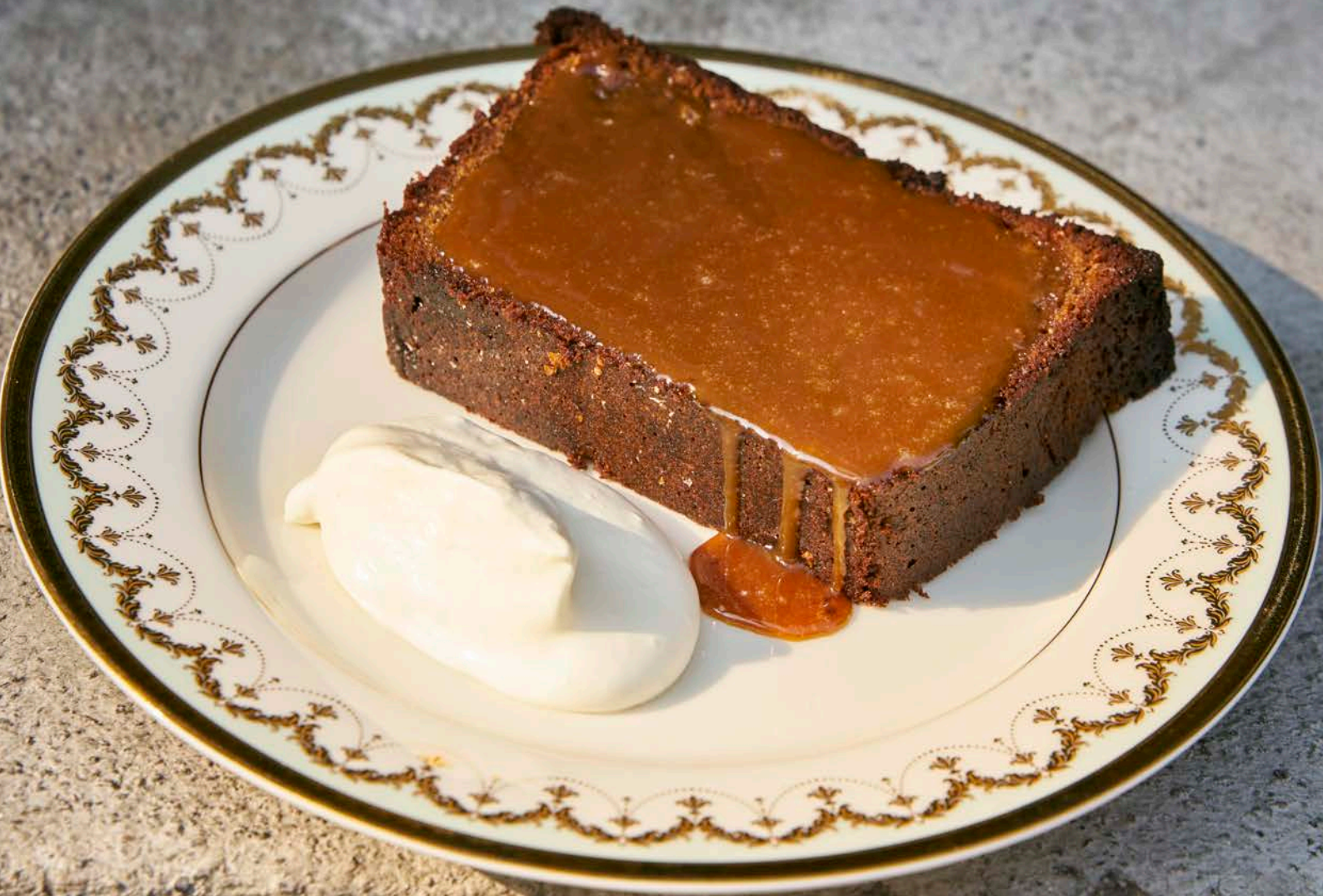
Banana Bread w/ Caramel & Whipped Cream 280